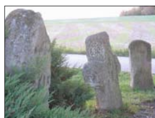
2 stone crosses